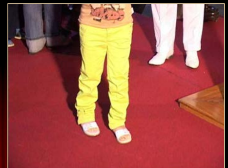
THE LORD STRETCHES TOTALLY LAME &amp; CROCKED LEGS, FACING INSIDE, HER LEGS STRAIGHTENED