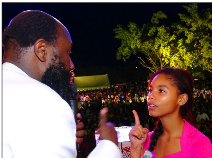
SAN PEDRO DE MACORIS, DOMINICAN REPUBLIC HEALING SERVICE 2013

Furthermore, this midnight clock is also meant to remind us of the ransom that Jesus of Nazareth paid to liberate mankind from the slavery of sin and satan. This is how Christ's own life was laid down by GOD THE FATHER as a ransom sacrifice for rescuing man. In so doing, this vision of the midnight clock has essentially reawakened the role of the victory that the LORD Jesus scored for us over satan, and that such a role consisted of swapping the life of the perfect Lamb of GOD for the lives of the imperfect men. In this case then, the Clock of GOD is reminding the church that Jesus Christ defeated satan in a bruising spiritual battle that freed the enslaved mankind thereby