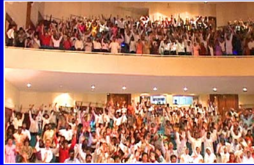
MIGHTY PASTORS' CONFERENCE

THE MAN OF GOD THE MIGHTY PROPHET warned the church in India to desist for falsehood in the church, false prophets, false apostles and the gospel of prosperity and return the church to the holiness & righteousness of the LORD and prepare her for the coming of the Messiah