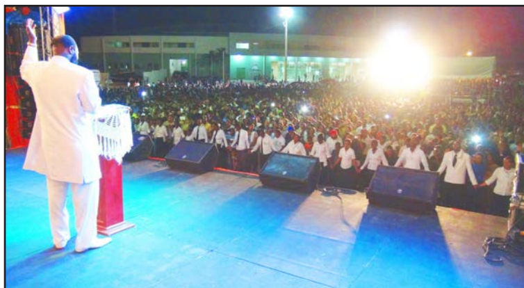
SAN PEDRO DE MACORIS, DOMINICAN REPUBLIC HEALING SERVICE 2013

today's modern church. In that way, this visitation is emphasizing the need for the present-day church of Christ to return to the original basics of the