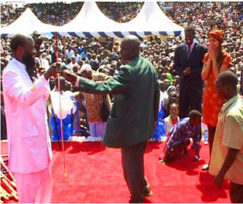
Totally blind eyes healed and surrenders white cane

the congregation, false prophets and false apostles in place, the LORD is indeed justified to question whether the church of Christ is at all covered by the BLOOD of Jesus.