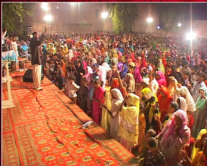
Many muslims received the LORD

nations inclusive, for the glorious coming of the Messiah. The central theme that this clock ministers unto the nations of the earth, is a dogma that underscores the need for the christian believers to begin the process of smearing the door frames of their Christians hearts with the perfect BLOOD of Jesus. In that way, this clock has become a heavenly host that points the nations to the Cross of Jesus, and a PREPARER of what is about to befall the earth. In so doing, this clock of GOD is vigorously drawing the attention of men to that genuine old biblical Calvary REPENTANCE of the BLOOD, and solemnly testifying concerning Jesus of Nazareth. It is a timely host that is boldly witnessing upon the coming of the glorious Kingdom of the Messiah, and the requirements on its citizenry . By warning the nations to prepare , this humongous golden clock in the sky, has become a faithful witness that is testifying a sombre caution on the coming judgment that will consume those who fail to heed its warning , and fall short of the benchmark for the midnight hour . This