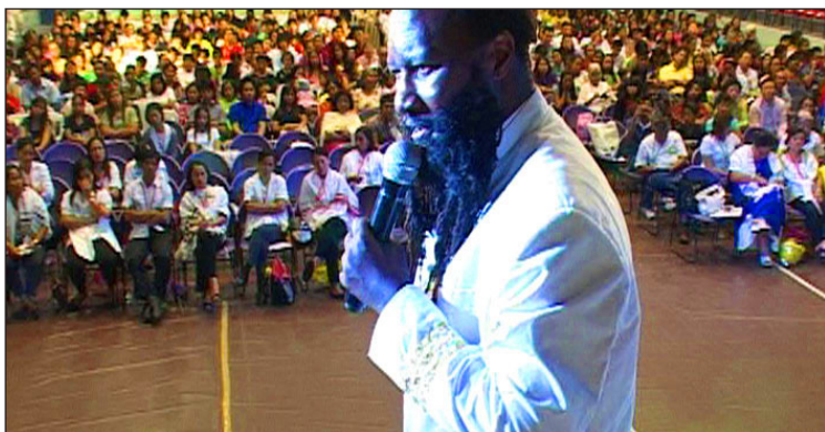
MANILA, PHILIPPINES HUGE PASTORS' CONFERENCE

defeating the captor. It is a sombre reminder of the high cost and price that Christ Jesus paid for the church's salvation. In this way, the LORD is using this vision to warn the present-day church that she cannot in any way continue abusing the grace owing to the high ransom paid.