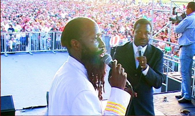
MASSIVE PASTORS' CONFERENCE

is hereby stressing that no amount of human effort as is today being witnessed in the church, can redeem anyone into the glorious Kingdom of GOD. No amount of human greatness can redeem a soul! However, the redemption of the church into the glorious Kingdom of GOD will only come from the observance of obedience to Christ and REPENTANCE that HIS BLOOD symbolizes. That the Cross is indeed the only way through which the present-day church can enter into eternity is undebatable . The LORD is therefore making it very clear that only through the BLOOD can man enter the rapture .