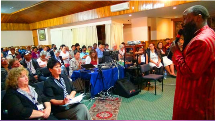
MIGHTY PASTORS' CONFERENCE

THE PROPHET cautioned the church in New Zealand to be careful because THE MESSIAH IS COMING and they should renounce the sin that has destroyed the church in New Zealand. He told them to wear the SACKCLOTH made of sisal and call for a National Repentance.