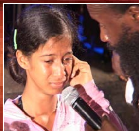
Totally Deaf Ears Pop Open