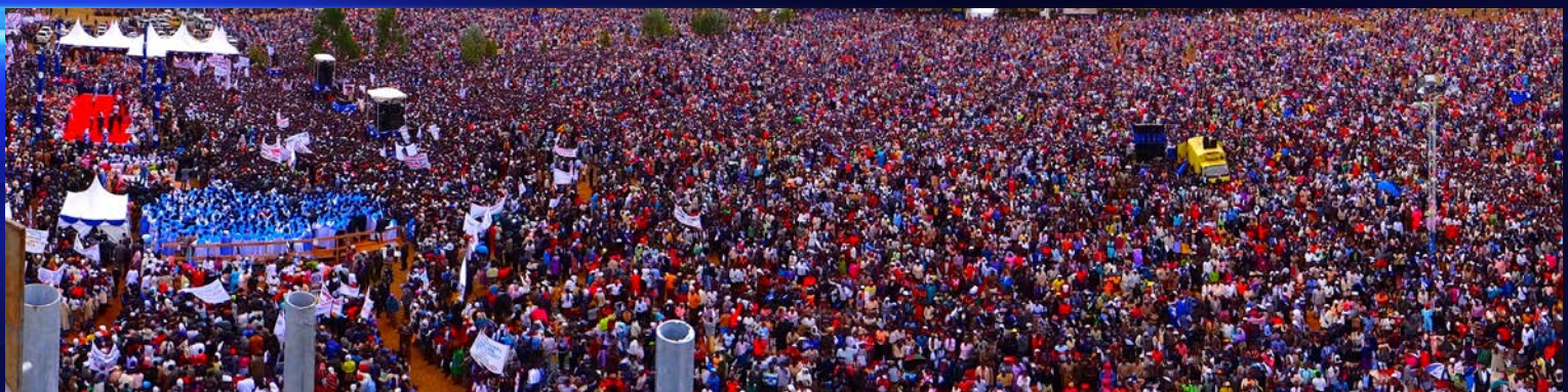
A SMALL SECTION OF THE MAMMOTH CROWD THAT GATHERED ON 45-ACRE SHOULDER TO SHOULDER PACKED MEETING OF THE LORD