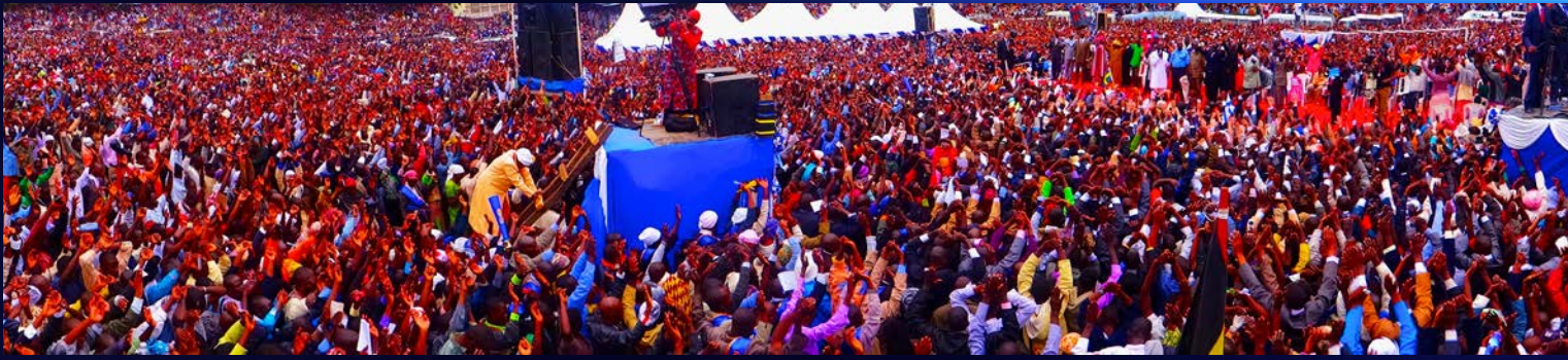
A SMALL section of the humongous crowd thronged the New Year's Eve Meeting of the LORD

closer, the GOD OF ISRAEL Spoke to them about the midnight hour at which HE would HIMSELF come down and put in place specific spiritual instruments that would realize that deliverance . In order to facilitate the roll-out of HIS deliverance program, GOD MOST HIGH put in place certain key benchmarks that Israel needed to observe, so as to draw the maximum from HIS divine intervention. The first standard that the LORD laid out, was that this deliverance be carried out at the midnight hour . That being the case, heaven explicated unto the Israelites what the midnight deliverance would entail. Describing it as a lift-off under the Eagle wings , the LORD went ahead to counsel Israel on the need to prepare for the midnight hour . As a result, the LORD sent Moses to command Israel to urgently put in place certain protocols for their midnight deliverance . Central among the procedures the LORD commanded Israel to observe, was the need to have in place three important elements; a lamb without blemish , bread without yeast and bitter herbs . These three elements that the LORD required of