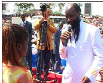
Deaf Ears Pop Open / The LORD literally popped open the deaf ears that they were now able to spontaneously react to sound. Praise the LORD

BLOOD of Jesus. The 11:59pm Clock that JEHOVAH lowered into the sky on May 3rd, 2007, therefore presented