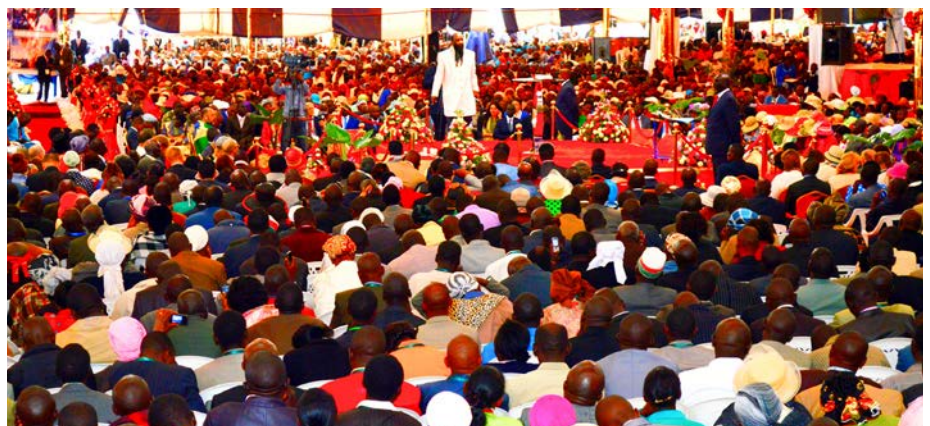
INTERNATINAL CONFERENCE OF PASTORS / AUGUST 29-31, 2014, NAKURU KENYA

3rd, 2007, HE practically trumped out the message of THE BLOOD! THE BLOOD! THE BLOOD! THE PERFECT BLOOD OF THE LAMB! ■