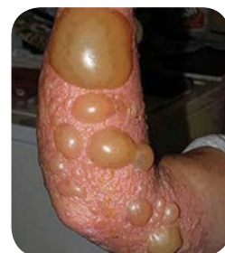
The blisters and moldings on the skin that the MAN OF GOD saw way back on October 8th, 2012.

who touches that disease, by greeting and shaking hands, will be infected. And it grows like leprosy over ones body and over anyone's body. When that disease does come, it will grow over the bodies of the people of the earth that are infected. It was a most disturbing dream. I was very disturbed when I woke up because it looks very bad. It was very unsightly when I saw it. Again I repeat, I see a severe form of skin infection. I don't know whether it's a disease inside the body that manifests in the skin, but it looks more like a skin infection because I saw the manifestation on the skin and all over the sides of the body. There were