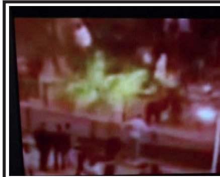
The Pale Horseman brings to the earth the pale colour implying death upon the face of the earth.

asserts that those whose names will be found written in the book of life of the Lamb, will be delivered. That can only imply that for mankind to suffer the tragedies of the horsemen. The pale horseman of the apocalypse saps away the livelihood and healthiness of mankind to the point that he lives the human being shrivelled and faint. He does this by intensifying the horrific effects of disease and sickness across the fibre of mankind. The overall effect of this fourth horseman appears to be that of rendering man totally unproductive and ineffective as a result of scavenging ravages of disease.